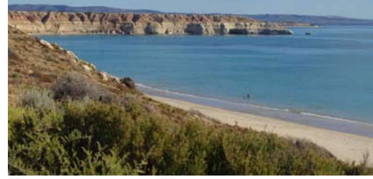
Friends of Willunga Basin inc. 2

A local action group has formed at Maslin Beach to oppose any such developments and is keen to work with FOWB to ensure that the community doesn't have to go through another major fight to prevent the disastrous damage that a marina cut into a sandy beach would cause. It is possible that the proponents, Nobletech, may now take up the option to appeal directly to the State Government. We will continue to monitor the situation.