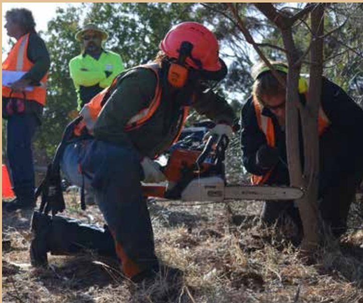
Biodiversity group members clearing woody weeds

On the subject of olive trees, congratulations to Council on its 'Free the Tree' project, which is removing feral olives that are choking large eucalypts on roadsides around the Willunga Basin. Keep a look out for the signs as you make your rounds.