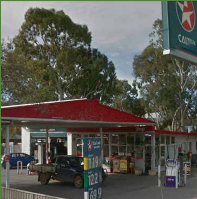
Willunga Service Station, showing trees slated for removal.

In its submission to the Council of August last year, FOWB stated that while it did not oppose the design of the structure itself, it raised concerns in particular about the proposed removal of three identified significant and regulated trees, all being river red gums ( E.Camaldulensis ), and proposed that the development be modified to reduce the level of destruction proposed.