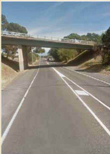
Above and right: Limited safe access by bicycle on Aldinga Road under and approaching Victor Harbor Road

FOWB maintains that Aldinga Rd is a hostile environment for cyclists, and a bit boring.