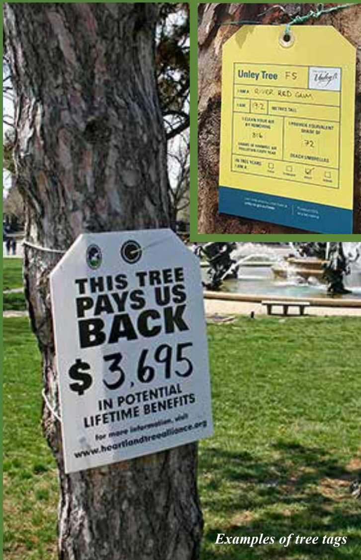
Examples of tree tags

A Red Gum walk in Willunga has been proposed for an initial project. We are delighted that Council appear keen to support this great project with funding for training of volunteers and support for the project.